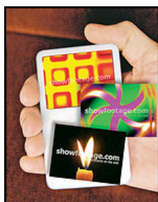
Here come the add-ons: A German company is already selling video iPod screen savers.

Apple Computer Inc. introduced its video iPod only two weeks ago, and already the add-ons are coming. Faster than you can say, "Hey, what you need on your new Mustang are some phat 20-inch chrome rims," a German company has begun selling screen savers for the vid-iPod.